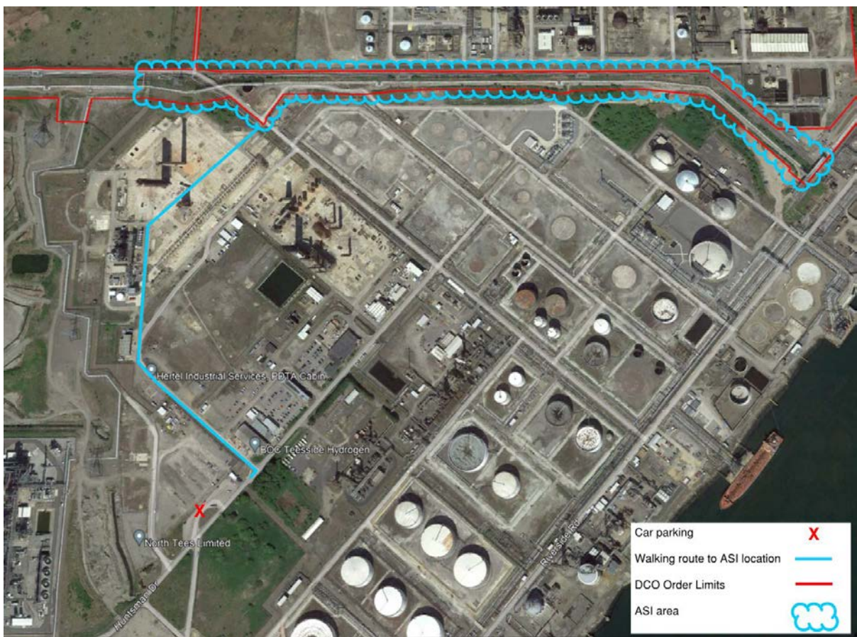
Figure 3 – Overview of ASI